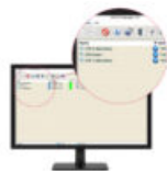
CLA15008 NRG+ PC Visualisation Software