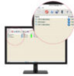
CLA15008 NRG+ PC Visualisation Software